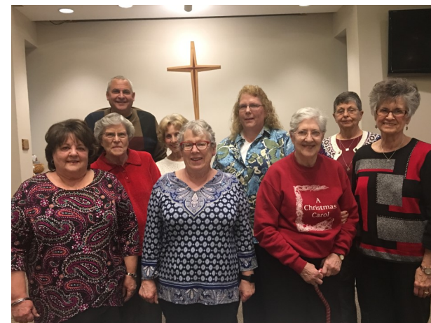
2019 UMW Officers